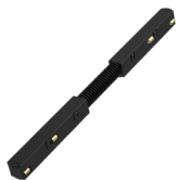
Corner connector module