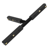
Three-ways connection module